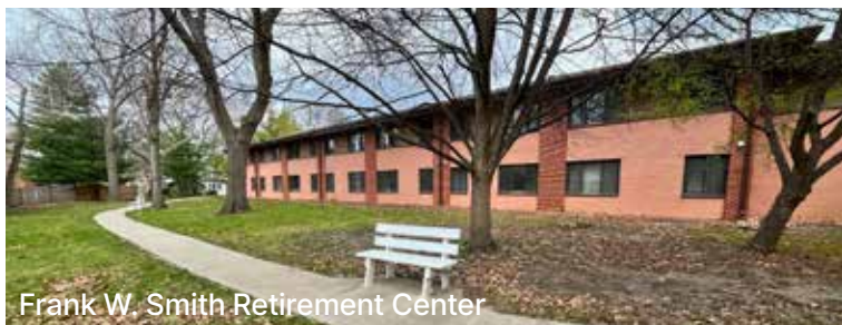
Frank W. Smith Retirement Center

The old hotel on Douglas and Merle Hay has been renovated and looking like a huge improvement for our extended neighborhood. Many of our retail strip centers are full as our neighborhood supports local so well. Let's keep it up! #ProudBeaverdalian