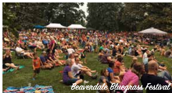
Beaverdale Bluegrass Festival